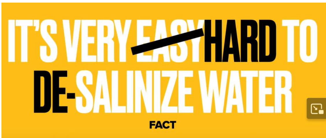
Image: Dugan, Hilary, March 30, 2023. Freshwater is the best water: How salt is a threat to our freshwater rivers and lakes presentation.

Deicing salts collected in soil percolate down to groundwater and increase chloride concentrations in your drinking water (well water.) People on low salt diets may be getting too much salt in their drinking water.