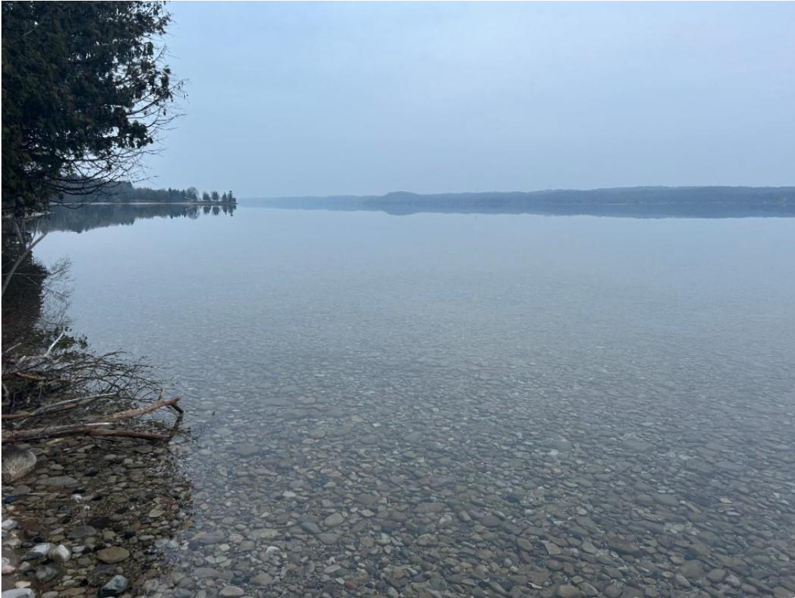
Cold, Clear Torch Lake