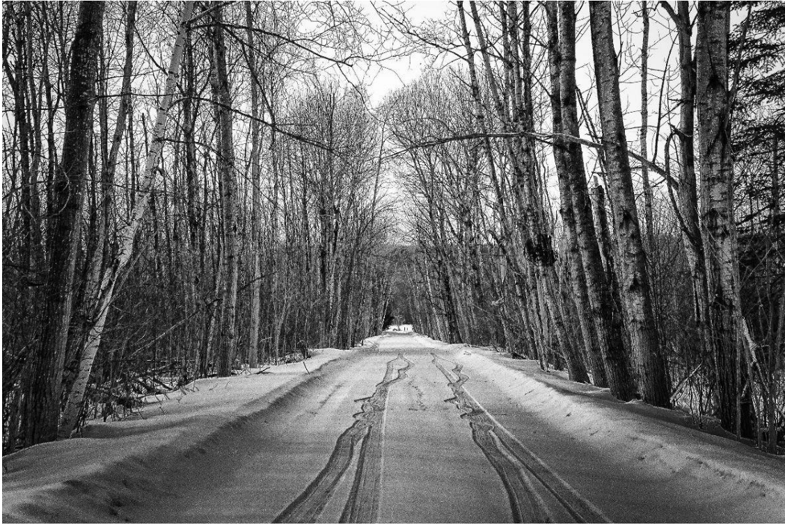
Wintery Torch Lake Road